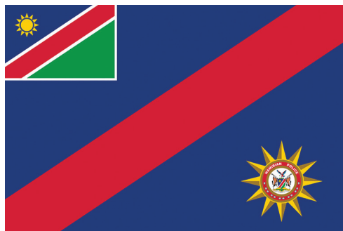
Flag of the Namibian Police Force since 1 November 2009