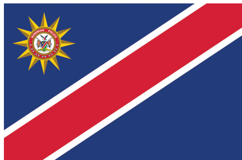
Flag of the Namibian Police Force until 31 October 2009

The Flag of the Namibian Police Force always takes secondary position when flown or hoisted together with the National Flag. The National Flag must be flown about 1,80 metres higher than other flags.