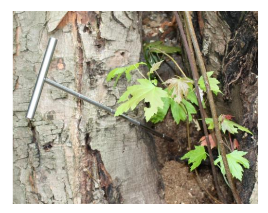
Pic. shows IML Probe Rod with application